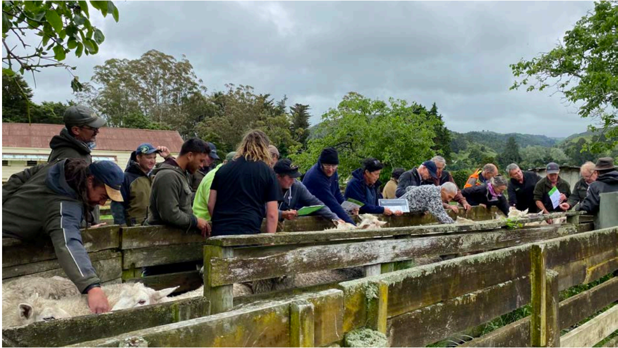
Practicing the Condition Scoring at the Feed Smart workshop and below working out feed availability using Beef+LambNZ tools