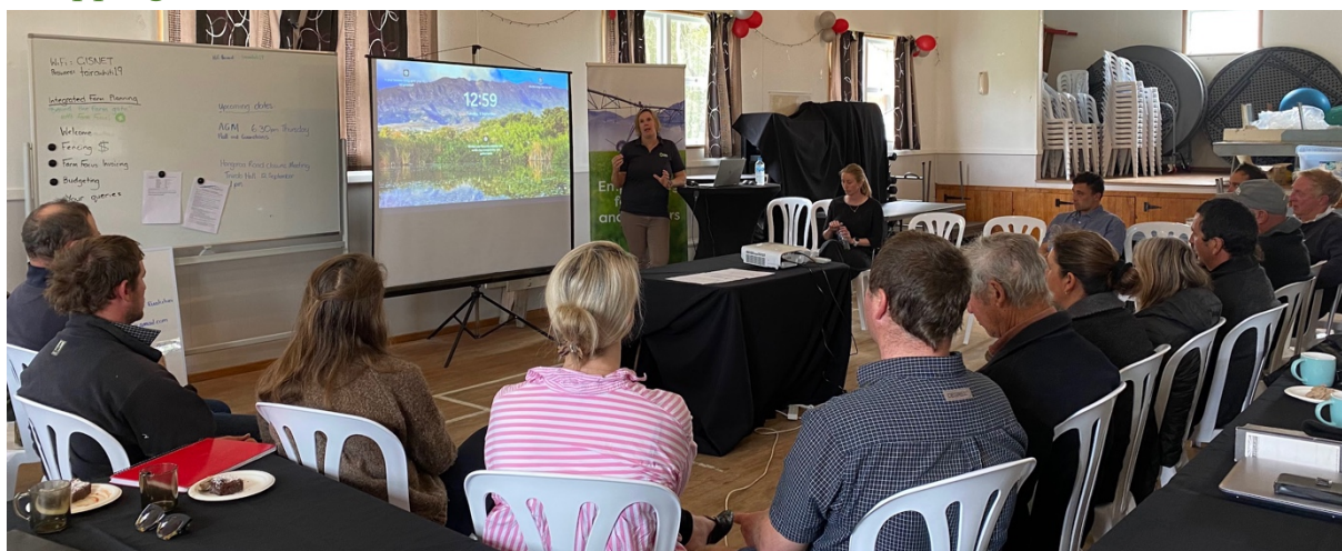
Catchment Farmers focus in on managing their money well at the Financial workshop